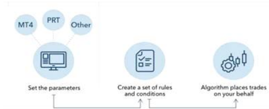
Fig. 2: How Automated Trading Works [11]

➤ Automated Trading: It automatically creates and submits order to stock market, eliminating the need of human intervention. The whole process begins with the defining the predefined rules for trade entries and their respective exit criteria [6]. On the basis of these predefined rules, strategies are formulated in online automated trading system. Once the system is finally set up, it continuously monitors the fluctuations in the real markets and hence searching for prospects where there could be a match for the predefined criteria. When the desired conditions are met, the trading system automatically runs the trade, including placing market orders, limit orders, or even more complex multi-leg options strategies. The entire process is shown in Figure 2.